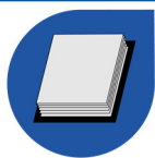
Bag with various quantities of wipes