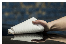
Poly-neat 2P3 220